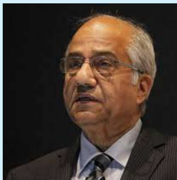
Justice B. N. Srikrishna , Retired Judge, Supreme Court of India delivered the Inaugural Lecture of the Institute Lecture Series on "The Indian Constitution" on March 12, 2016.