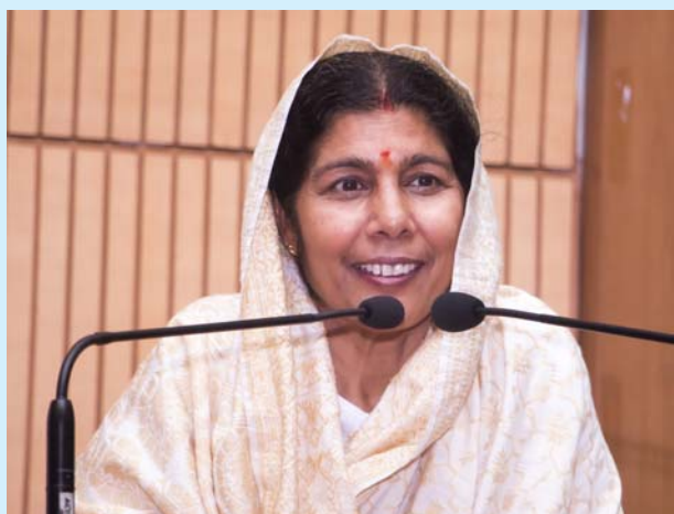
Ms. Santosh Yadav , Everest Foundation delivered the Second Annual Radhika Rajan Leadership Lecture titled "Motivation, Team Building, Leadership and Risk Management – An Everest Conqueror's Story" on March 2, 2016.