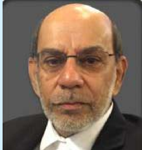
Mr. Aspi Chinoy , Advocate and Senior Counsel of Bombay High Court and the Supreme Court of India, delivered the Second Lecture of the “Institute Lecture Series on the Indian Constitution” titled ‘ The Nature, Import and Effect of a Constitution ’ on April 2, 2016.